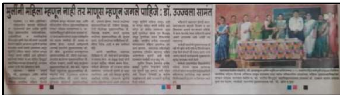
International Women’s Day – 08/03/2022 News