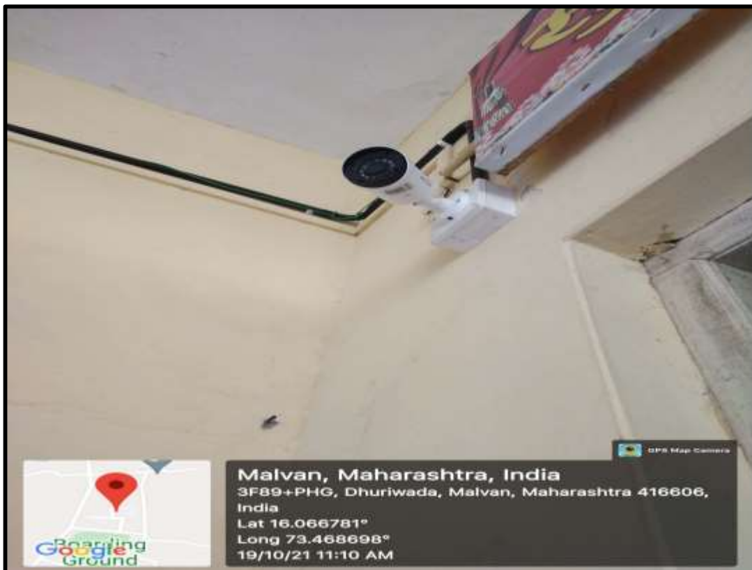
Security- CCTV Cameras