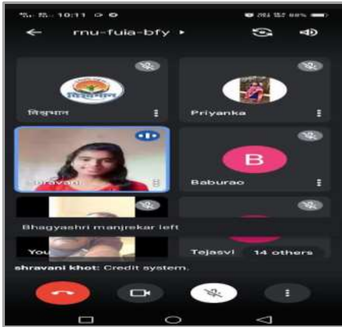
Online poetry reading program for girl students - 10/08/2021