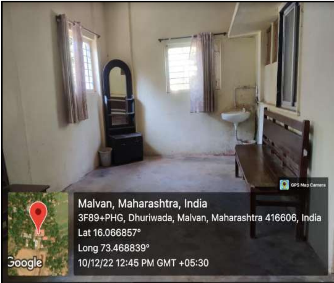
Specific Facility – Ladies Common Room