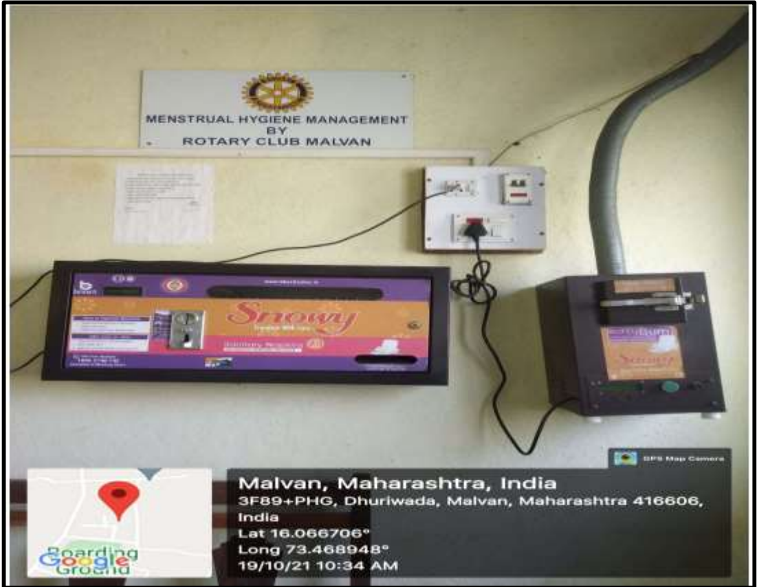
Sanitary Pad Vending Machine and Incinerator.