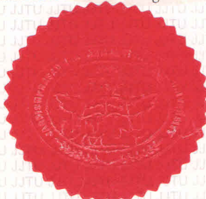
Chancellor/Chairman कुलाधिपति / चेयरमेन

A Study Of Demographic Characterstics In Sindhudurg District.